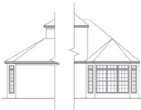
Master Retreat Option