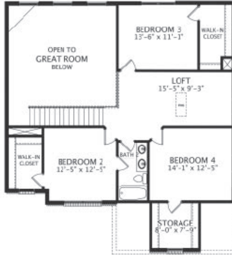
4 Bedroom Option