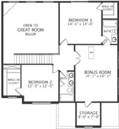
Bonus Room Option