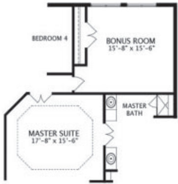
Front Master Option