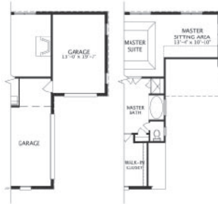
3rd Car Single Option