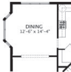
Dining Room Bay Option