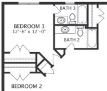
Bath 3 Option